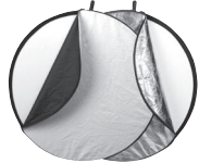
OPL - R32 32" Collapsible Reflector