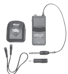
OPL - WTS Remote Flash Trigger System